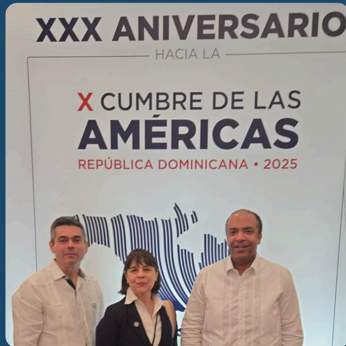
Photo: YABT representative with the CEO of the Banreservas.